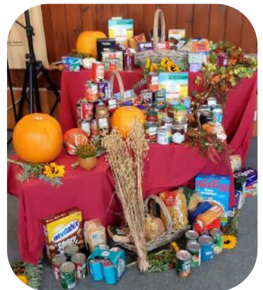
Our harvest gifts went to the food bank